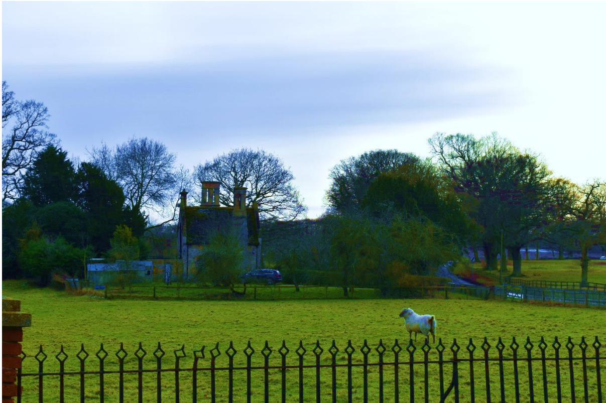
Aswarby Lincolnshire