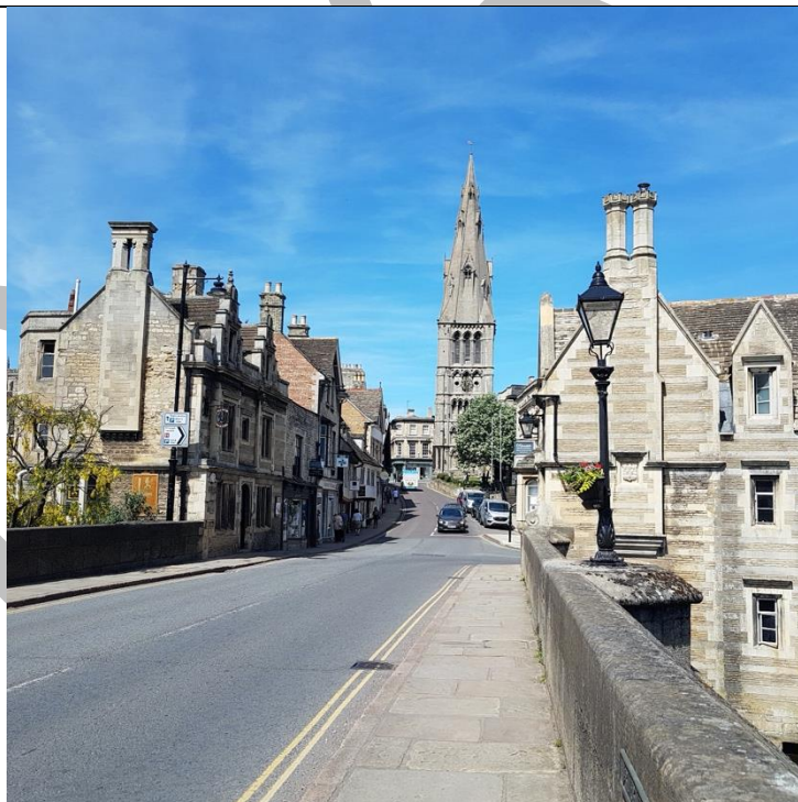
Stamford