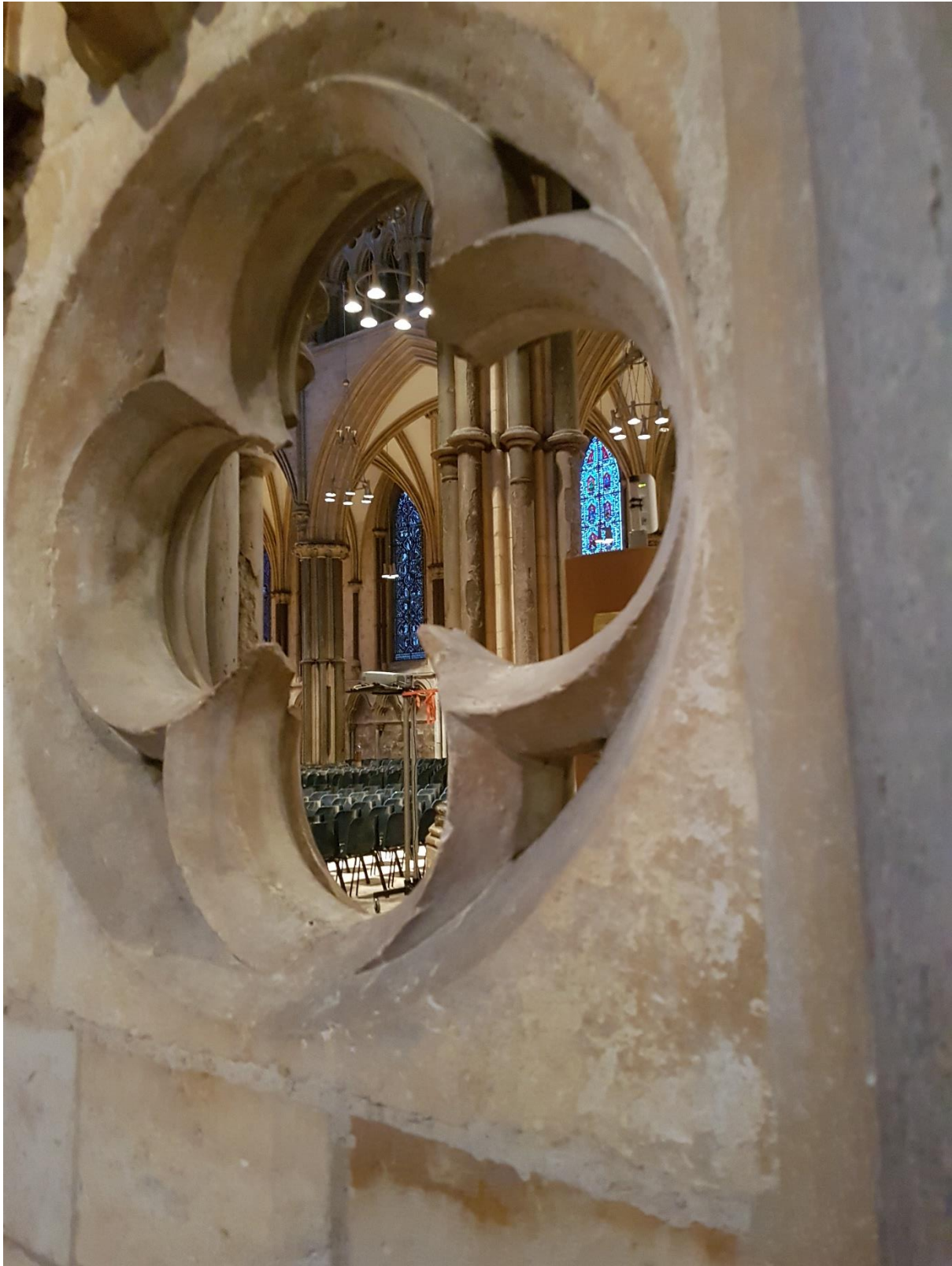
Lincoln Cathedral