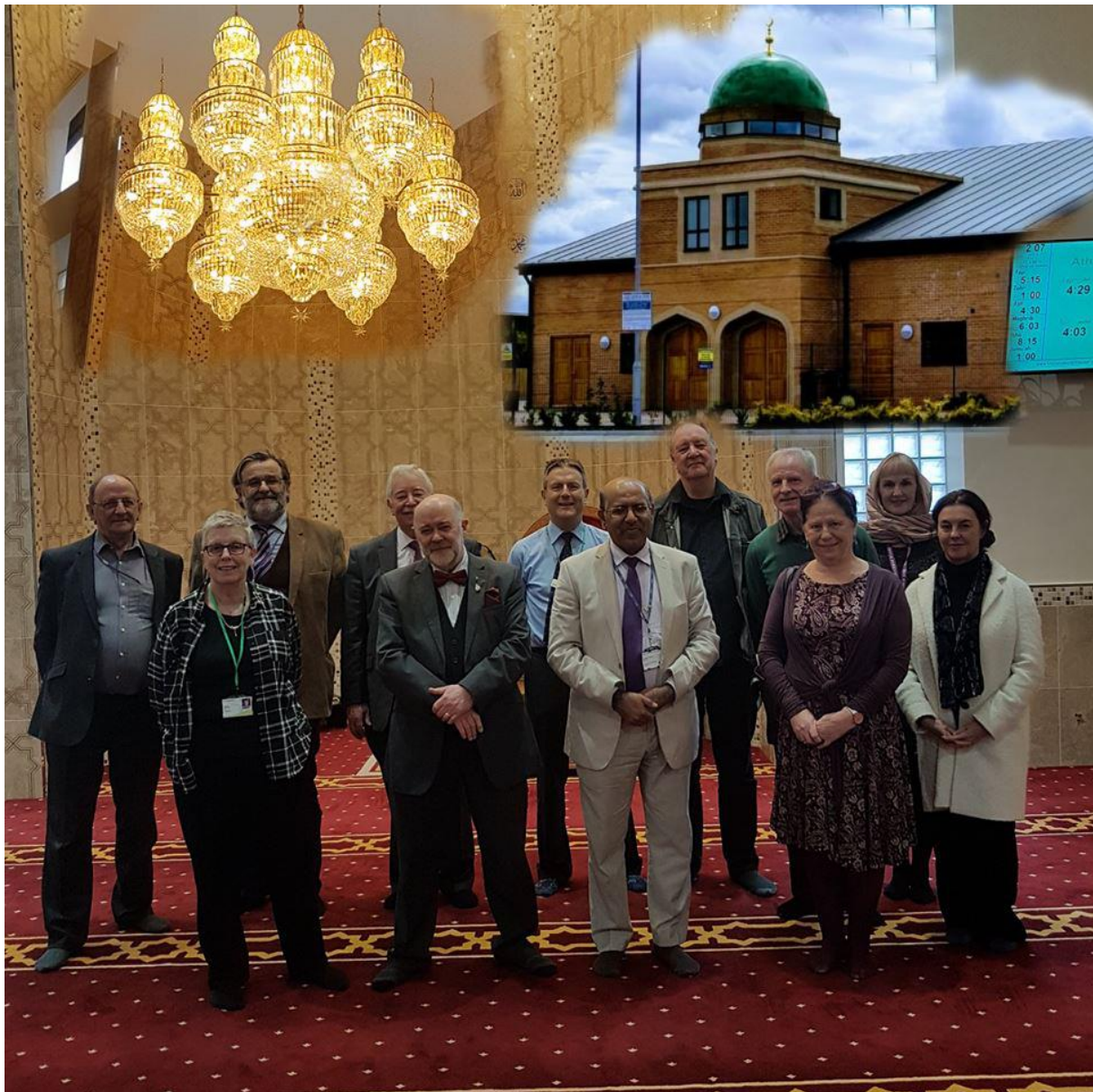
Visit to Lincoln Mosque by SACRE Members