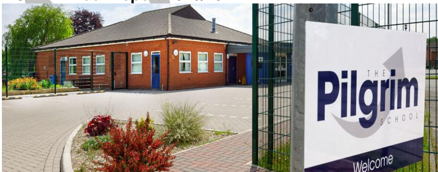
Pilgrim School, Boston: