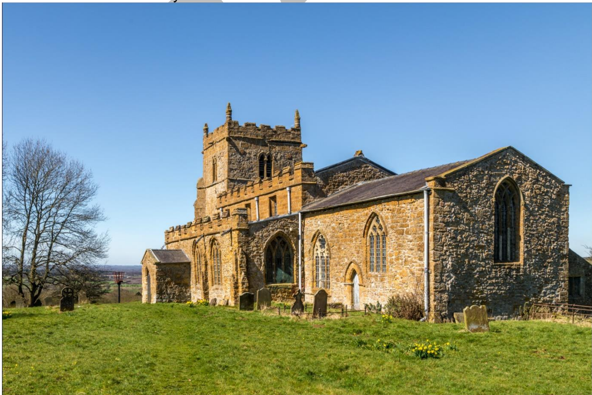
Normanby Le Wold, Lincolnshire

Church schools from across North East Lincolnshire came together to share their learning at Grimsby Minster. The theme for the day was 'teamwork.' Activities helped pupils explore stories from the gospels to learn more about Christian beliefs about teamwork and community.