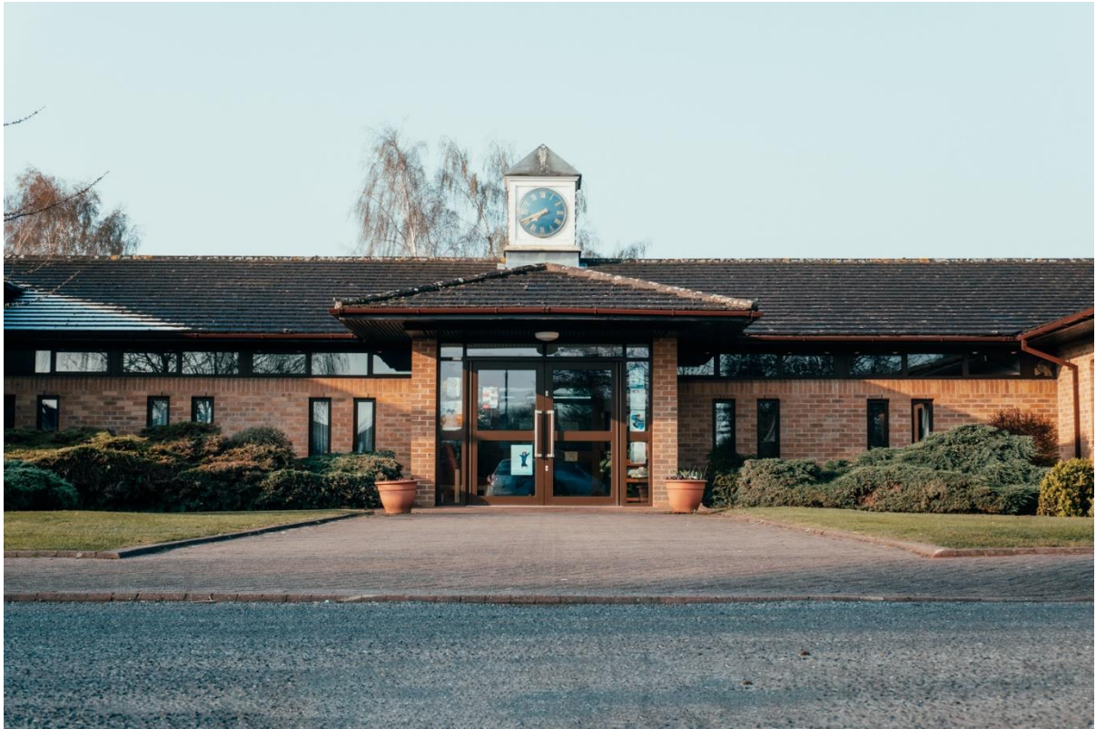
St Hughes Primary School, Lincoln from school website.